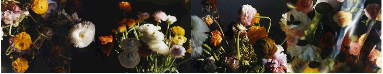
Ranunculus 2007 Archival Pigment Print 96 x 19" Edition of 5

CARROLL AND SONS 450 HARRISON AVENUE, BOSTON, MASSACHUSETTS 02118 PHONE: 617-482-2477 FACSIMILE: 617-482-2549 INFO@CARROLLANDSONS.NET