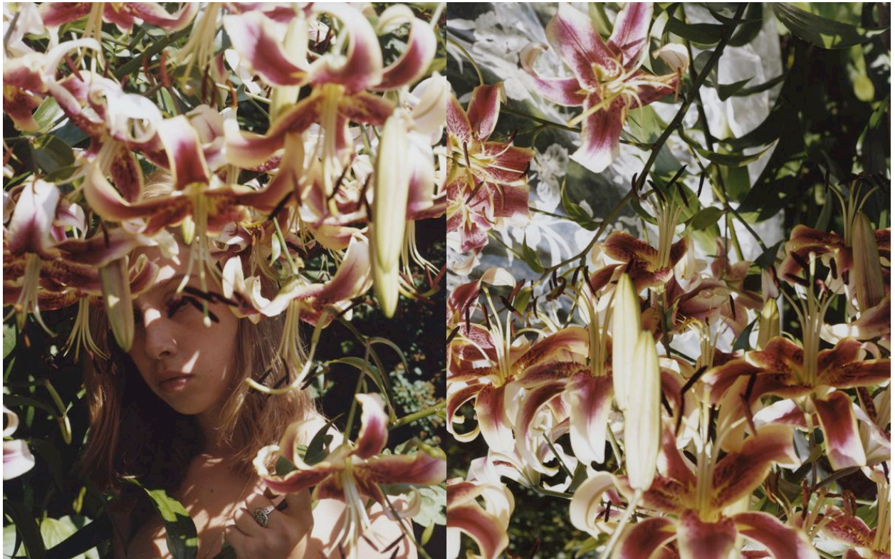
Fourteen 2010 Archival Pigment Print 48 x 76 ¼" Edition of 5