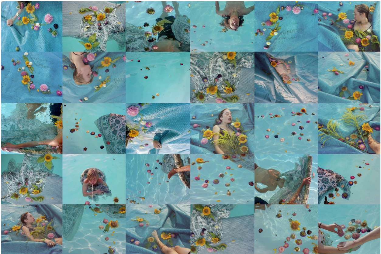
Thirteen and Nine