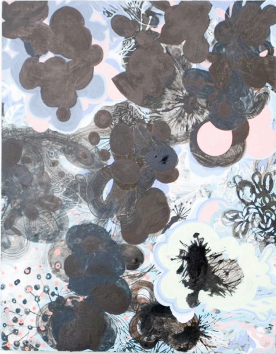
Untitled, 2010 Gouache, acrylic on panel 14 x 11"

CARROLL AND SONS 450 HARRISON AVENUE, BOSTON, MASSACHUSETTS 02118 PHONE: 617-482-2477 FACSIMILE: 617-482-2549 INFO@CARROLLANDSONS.NET