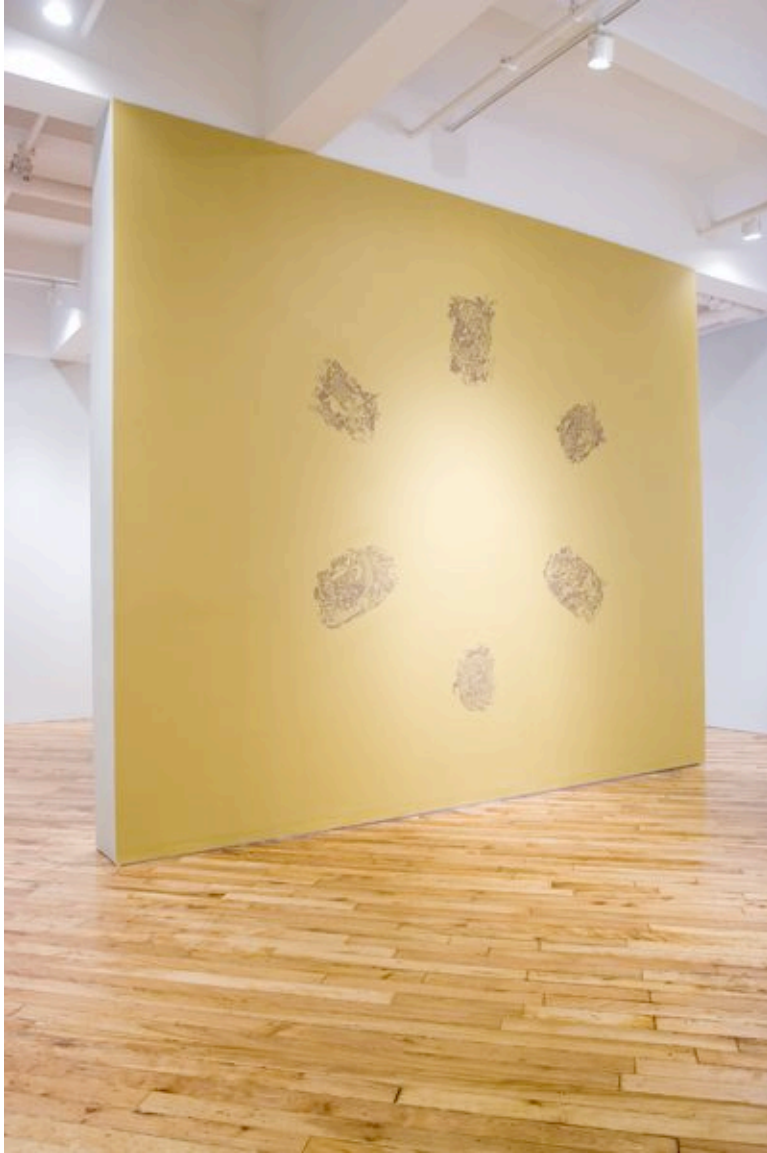
Wheel Turner , 2010 Laser cut sheetrock with latex paint 12 panels, 18 x 24" each, inset into wall with 2 circles of 6, 8 ft in diameter Edition of 6

CARROLL AND SONS 450 HARRISON AVENUE, BOSTON, MASSACHUSETTS 02118 PHONE: 617-482-2477 FACSIMILE: 617-482-2549 INFO@CARROLLANDSONS.NET