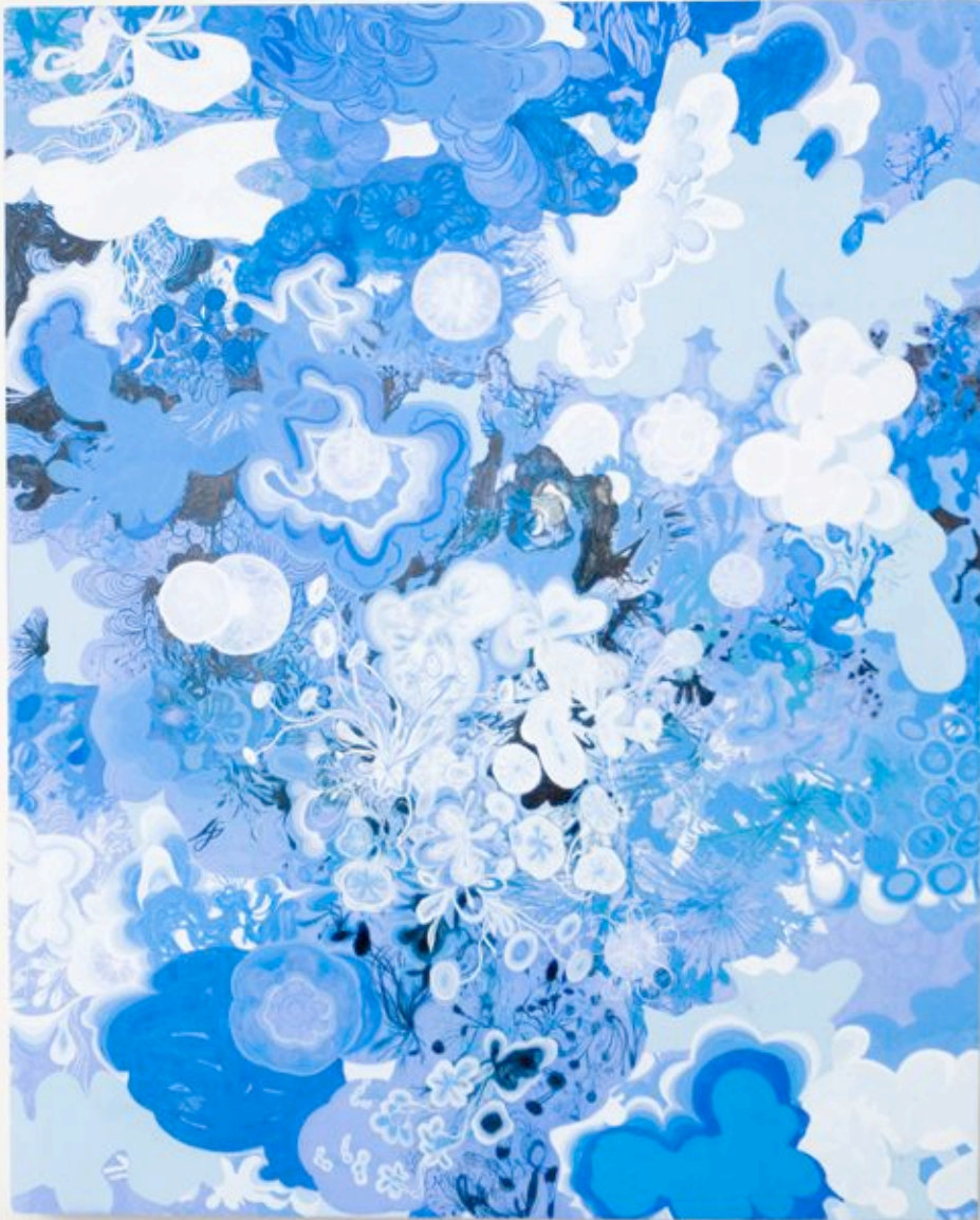
Uncertainty Principle, 2010 Gouache, acrylic on panel 20 x 16"

CARROLL AND SONS 450 HARRISON AVENUE, BOSTON, MASSACHUSETTS 02118 PHONE: 617-482-2477 FACSIMILE: 617-482-2549 INFO@CARROLLANDSONS.NET