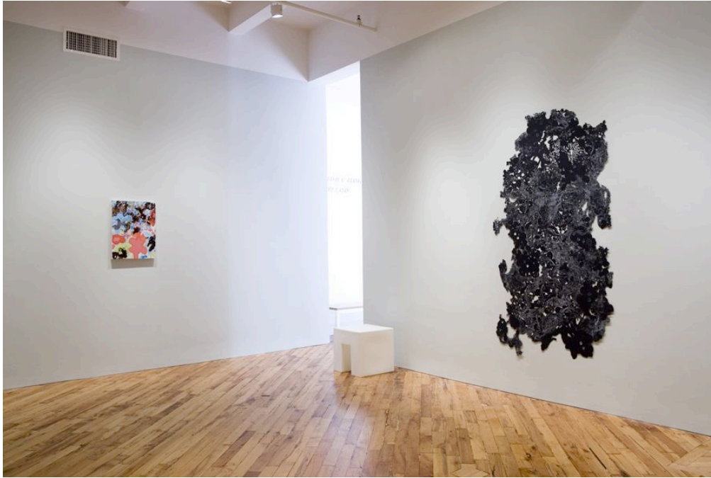
Installation View 1