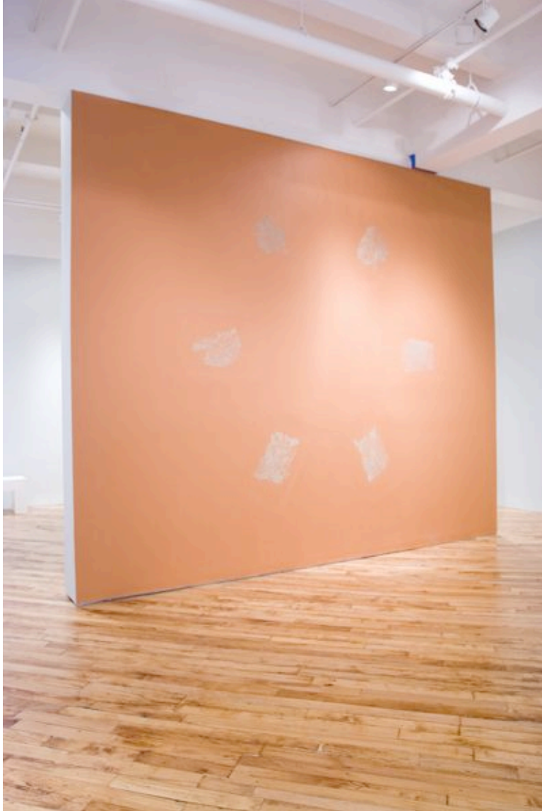
Wheel Turner , 2010 Laser cut sheetrock with latex paint 12 panels, 18 x 24" each, inset into wall with 2 circles of 6, 8 ft in diameter Edition of 6

CARROLL AND SONS 450 HARRISON AVENUE, BOSTON, MASSACHUSETTS 02118 PHONE: 617-482-2477 FACSIMILE: 617-482-2549 INFO@CARROLLANDSONS.NET