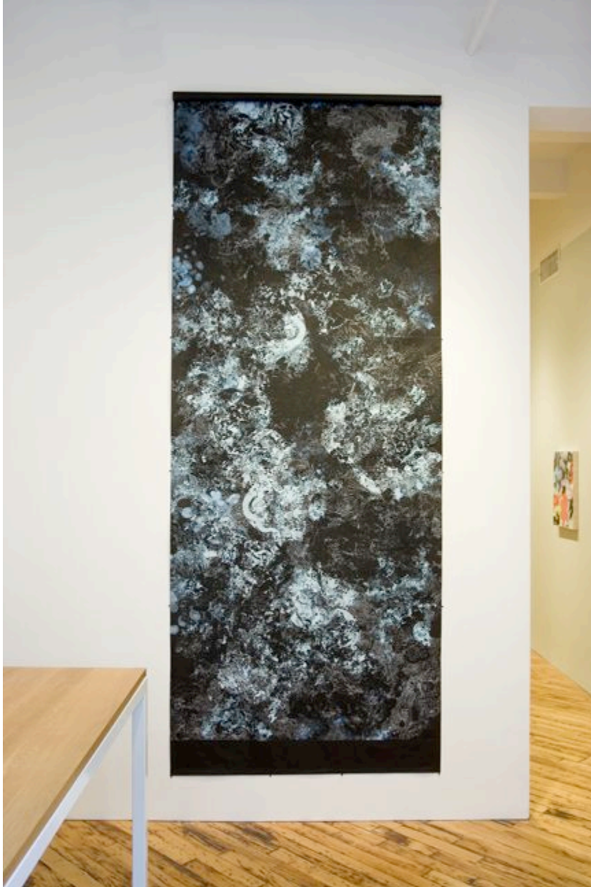
Asian Causation, 2010 Gouache, ink, silkscreen on Chinese Tuan Zhi calligraphy paper 170 x 51"

CARROLL AND SONS 450 HARRISON AVENUE, BOSTON, MASSACHUSETTS 02118 PHONE: 617-482-2477 FACSIMILE: 617-482-2549 INFO@CARROLLANDSONS.NET