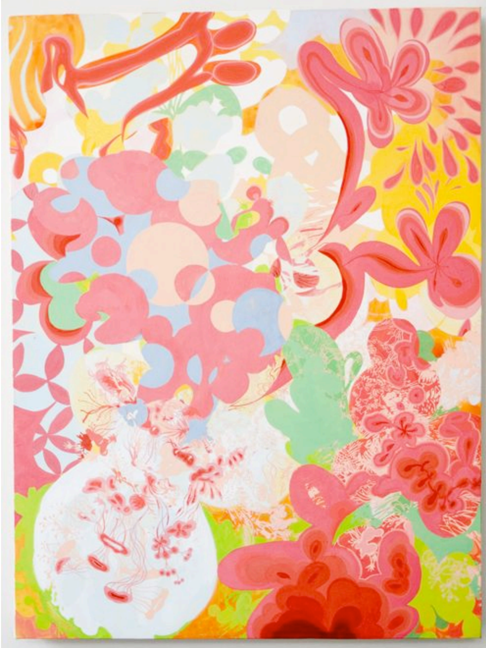
Everything is Burning, 2010 Gouache, acrylic on prepared panel 24 x 18"

CARROLL AND SONS 450 HARRISON AVENUE, BOSTON, MASSACHUSETTS 02118 PHONE: 617-482-2477 FACSIMILE: 617-482-2549 INFO@CARROLLANDSONS.NET