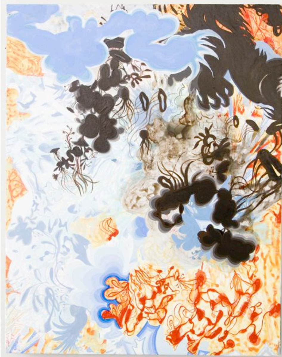
Blistering Sun, 2010 Gouache, acrylic on panel 14 x 11"

CARROLL AND SONS 450 HARRISON AVENUE, BOSTON, MASSACHUSETTS 02118 PHONE: 617-482-2477 FACSIMILE: 617-482-2549 INFO@CARROLLANDSONS.NET