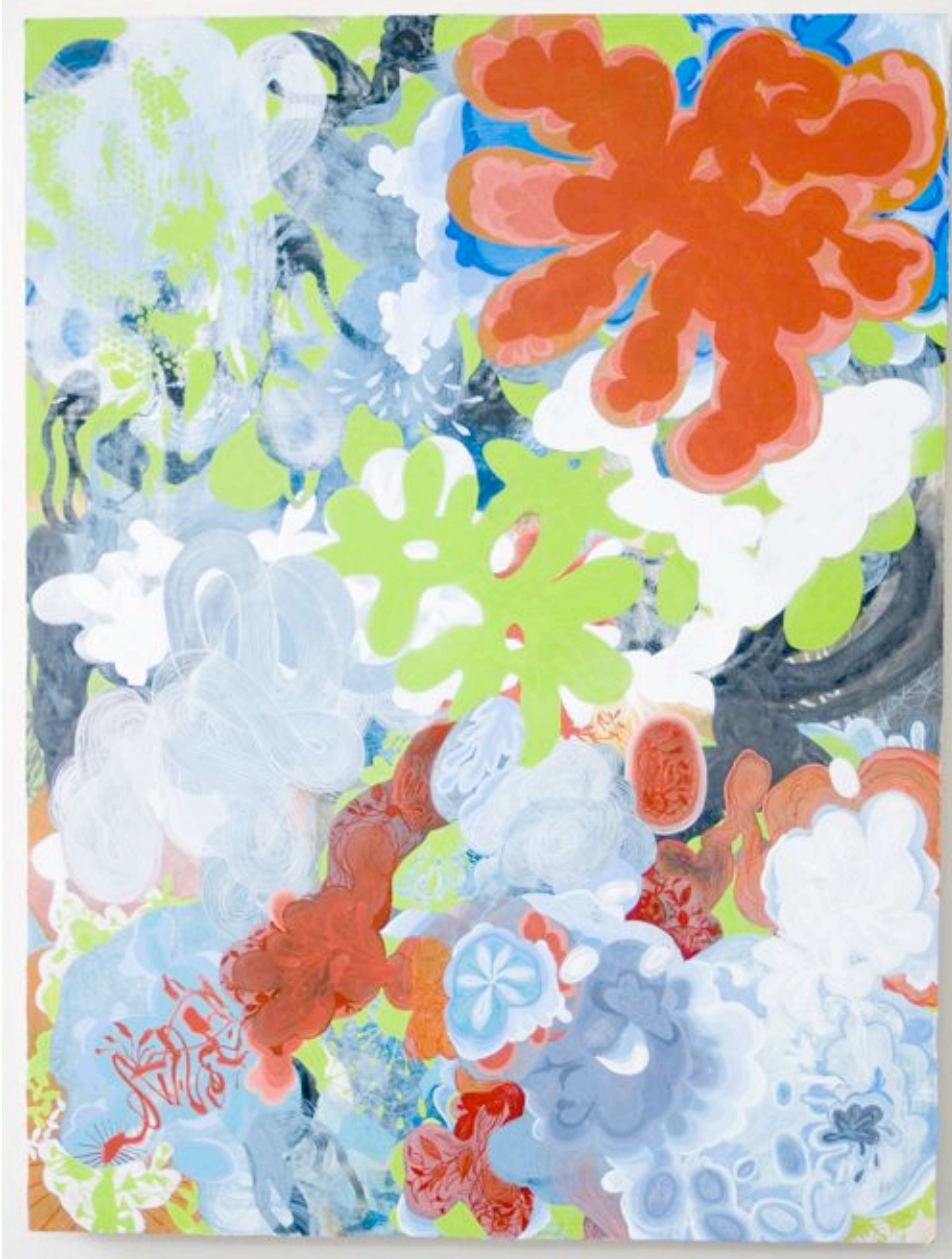
A Stream to a River, 2010 Gouache, acrylic on prepared panel 24 x 18"

CARROLL AND SONS 450 HARRISON AVENUE, BOSTON, MASSACHUSETTS 02118 PHONE: 617-482-2477 FACSIMILE: 617-482-2549 INFO@CARROLLANDSONS.NET