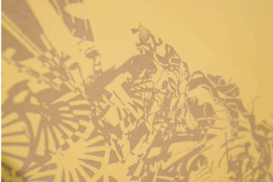
Detail from Wheel Turner , 2010

CARROLL AND SONS 450 HARRISON AVENUE, BOSTON, MASSACHUSETTS 02118 PHONE: 617-482-2477 FACSIMILE: 617-482-2549 INFO@CARROLLANDSONS.NET