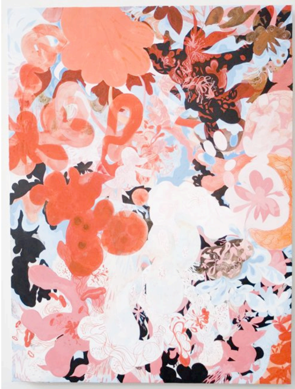
Seed in the Partridge, 2010 Gouache, acrylic on prepared panel 24 x 18"

CARROLL AND SONS 450 HARRISON AVENUE, BOSTON, MASSACHUSETTS 02118 PHONE: 617-482-2477 FACSIMILE: 617-482-2549 INFO@CARROLLANDSONS.NET