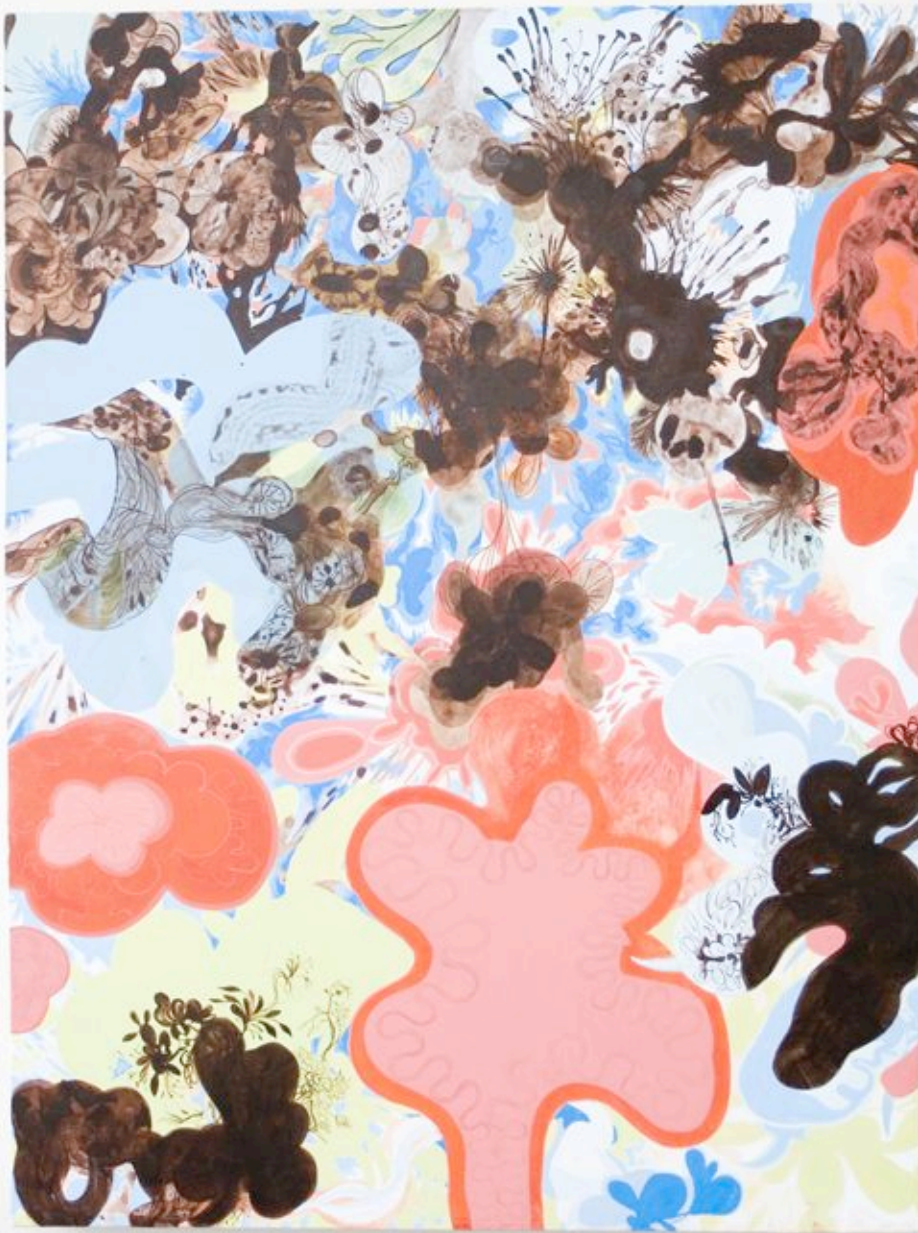
A Paddle to the Sea, 2010 Gouache, acrylic on prepared panel 24 x 18"

CARROLL AND SONS 450 HARRISON AVENUE, BOSTON, MASSACHUSETTS 02118 PHONE: 617-482-2477 FACSIMILE: 617-482-2549 INFO@CARROLLANDSONS.NET