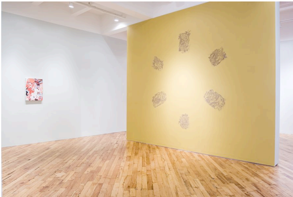
Installation View 2