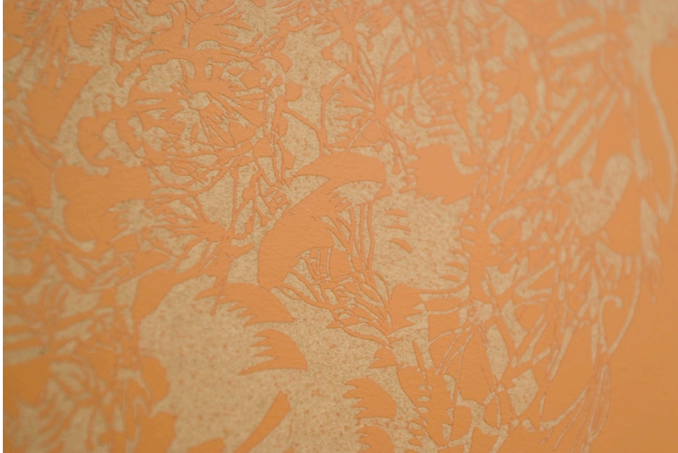
Detail from Wheel Turner , 2010

CARROLL AND SONS 450 HARRISON AVENUE, BOSTON, MASSACHUSETTS 02118 PHONE: 617-482-2477 FACSIMILE: 617-482-2549 INFO@CARROLLANDSONS.NET