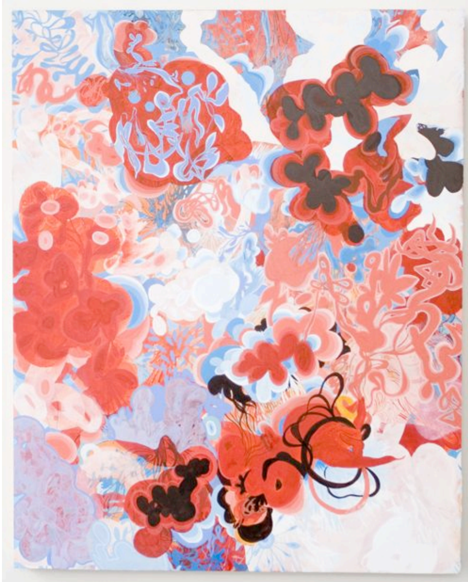
Untitled, 2010 Gouache, acrylic on panel 14 x 11"

CARROLL AND SONS 450 HARRISON AVENUE, BOSTON, MASSACHUSETTS 02118 PHONE: 617-482-2477 FACSIMILE: 617-482-2549 INFO@CARROLLANDSONS.NET